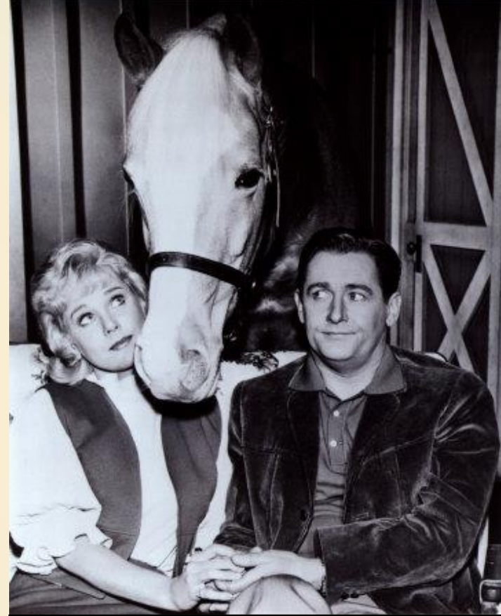
Connie Hines, Bamboo Harvester, Alan Young