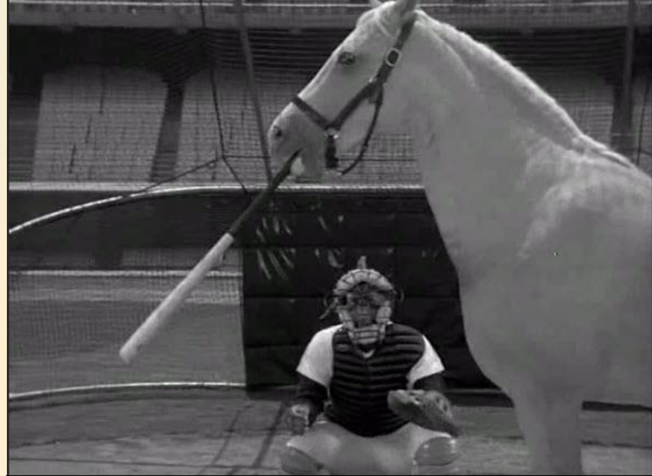
A Scene from 1963, Leo Durocher meets Mr. Ed