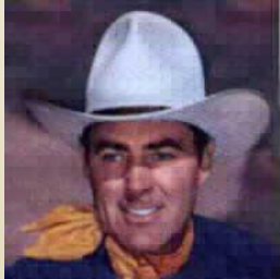
Allan "Rocky" Lane 1904-1973