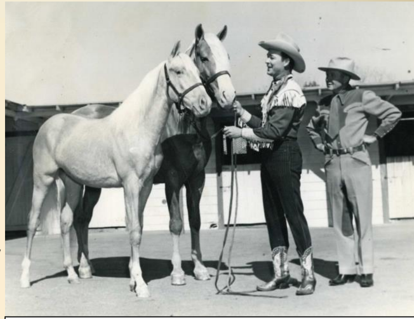
Trigger and Trigger Jr. were registered with the Palomino Horse Association